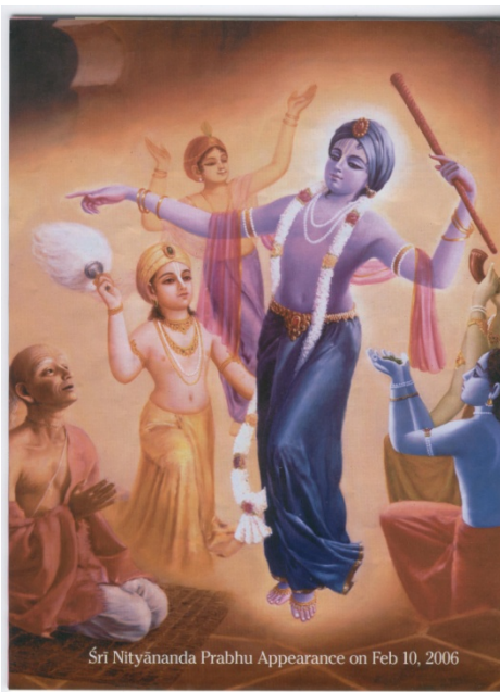
Śrī Nityānanda Prabhu Appearance on Feb 10, 2006

Conchshells, bells, and karatālas resound, and the mṛdaṅgas play very sweetly. This kīrtana music is supremely sweet and relishable to hear.